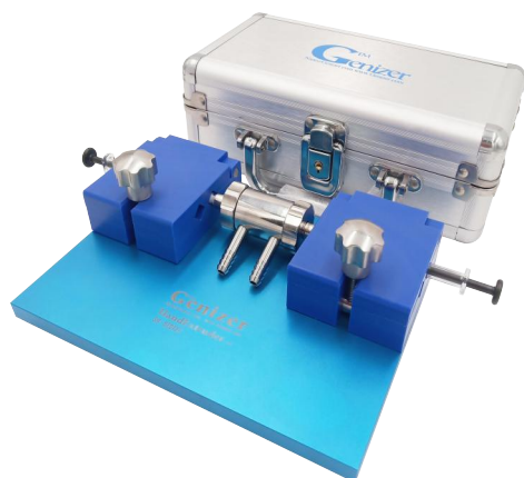
HnadExtruder-RT (Packed with Genizer Box)