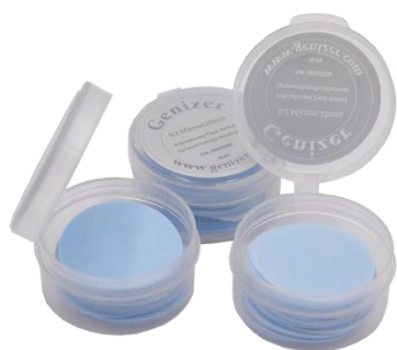
Track-Etched Liposome Membranes (19mm)